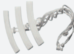
EAA0304G52A - Plastic rim protector set