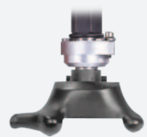
EAA0304G36A - Quick exchange device