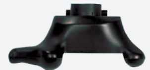
EAA0247G20A - Plastic mounting head

For more information regarding the monty® 1270, call 800.251.4500 (US) or 501.505.2662 (Canada) www.hofmann-equipment.com