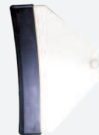
EAA0304G15A - Protector bead breaker shovel